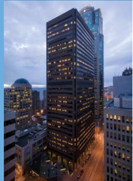
1111 Third Avenue Seattle, WA