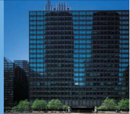
10 South Riverside Plaza Chicago, IL